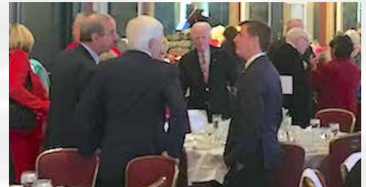
Our members gather for lunch