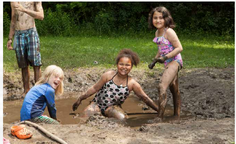
Kids just LOVE mud!