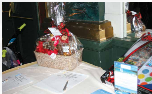
A Successful Silent Auction