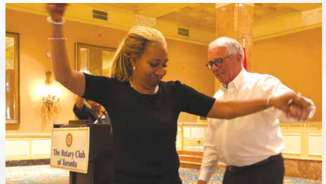
Rotarians have all the right moves