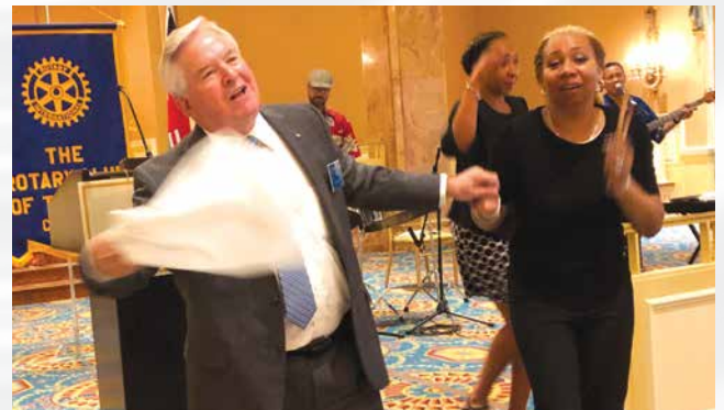
“Hot Hot Hot” hit all the right notes