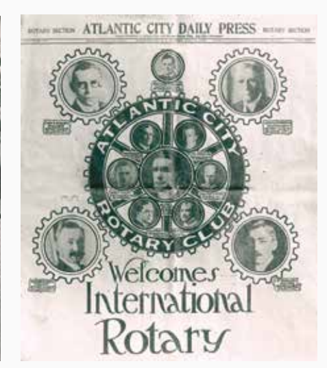
Good press for our 1920 RI Convention