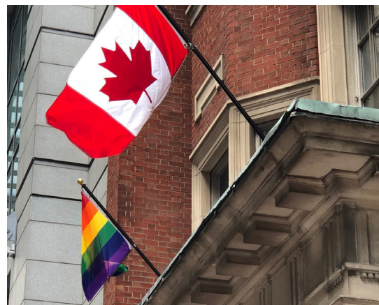
Flags at the National Club