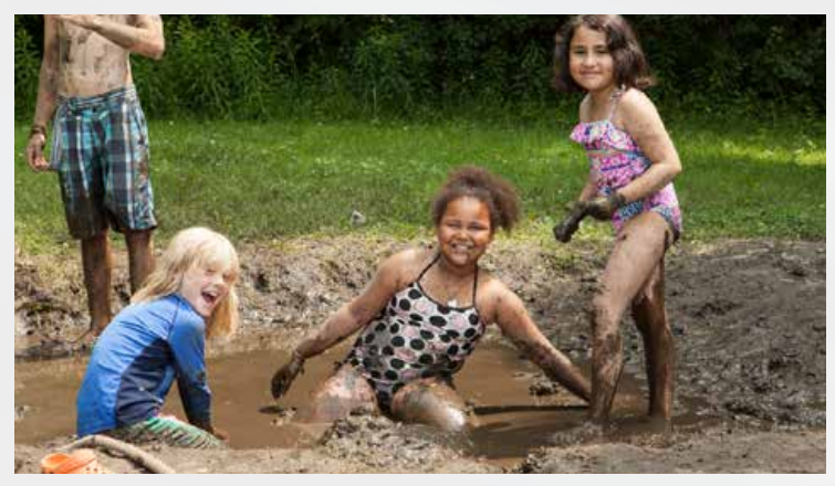
Kids just LOVE mud!

Sign up now! Where else will you get five meals prepared by our master chef members and two nights accommodation for only $120? (Rotaractors are $90) – and don't forget fun and friendship!