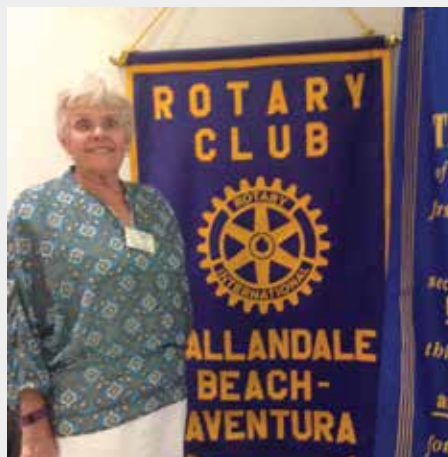
With Club Banner