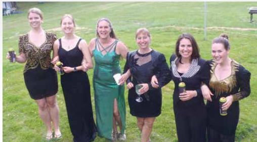
Grownups like dress-up too!

This camp services some of the most needy of the GTA. One of their highlights is Dress-up. So collect those fancy things you will never wear, that shirt your wife hates, fancy shoes, and especially NAIL POLISH! Clean out those drawers now and bring to the office – or just to camp in May. The kids will love you for it!