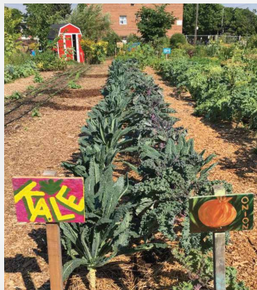
Even if you don't like kale, it's a restful and welcoming place

A community compost program encourages local residents to trade kitchen scraps for healthy organic produce. Workshops curriculum have been developed for high school and elementary students integrating concepts of science, business, writing and culinary art to name a few.