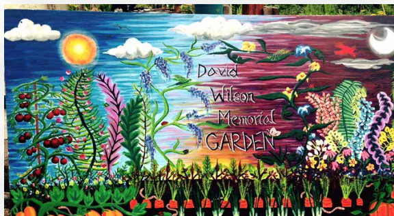
Welcome to the Wilson Memorial Garden

In the summer, it is tended by volunteers, students, at risk-youth and practicum placements for college and university students.