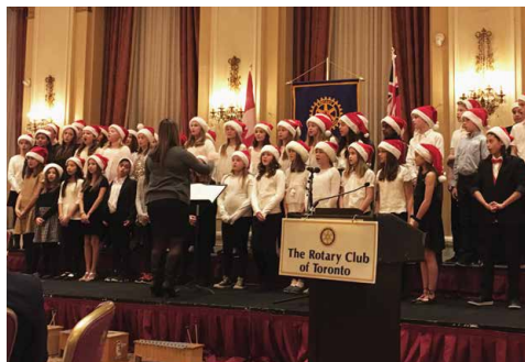
The Children's Chorus from Crescent Middle School