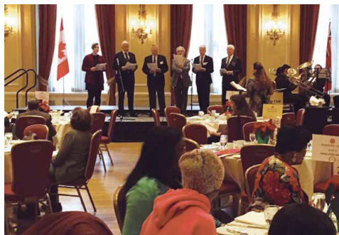
The Salvation Army Band and The Rotary Singers entertaining at last year's Christmas Party.

Rotarians, Rotaractors, the Toronto Police Services and a few others all lend a hand to make this Christmas lunch celebration possible.