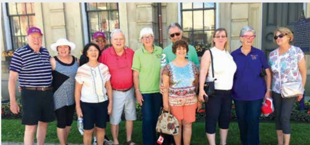
The happy gang!

There is a Rotary Fellowship for everyone. Check out https://www.rotary.org/en/our-programs/more-fellowships