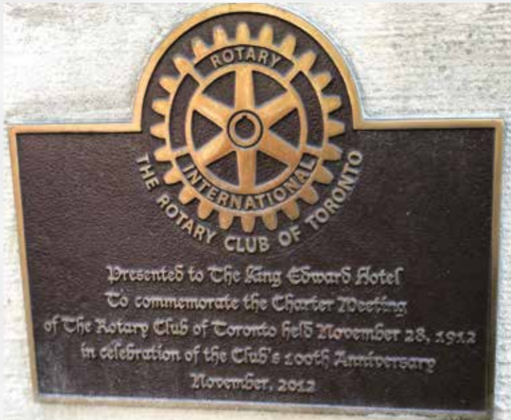
Plaque presented by the Rotary Club to the King Edward Hotel, 2012