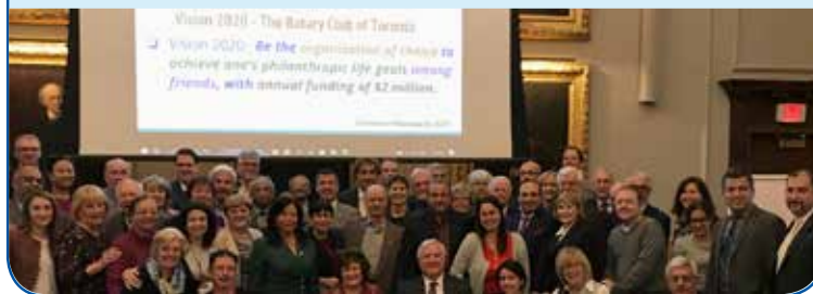
Unveiling our new vision statement at last year's Club Assembly

This is a member only event. It is your club and we need your thoughts as to where and how we go forward.