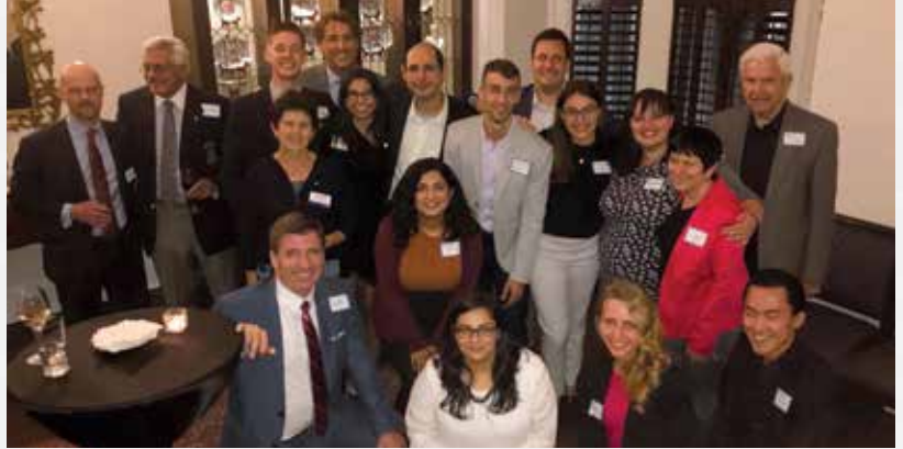
Our R2R attendees. Join us November 1st