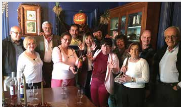
The Rotary Wine tour group