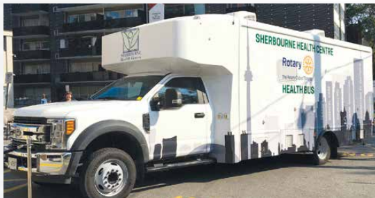
The new generation Sherbourne Health Bus.

The lively event welcomed over 80 guests, including members from The Rotary Club of Toronto and the Rotary Club of Toronto Charitable Foundation, as well as Sherbourne clients, staff, volunteers, donors, community members and supporters. Attendees enjoyed fantastic weather and fun festivities, which included tours of the new bus, music and refreshments, an information table, and a video highlighting the Health Bus's evolution throughout its 20+ years of service.