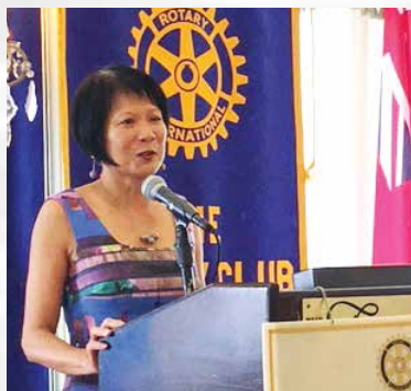
Olivia Chow delivers a passionate speech about the needs of the child and child care workers in Ontario.