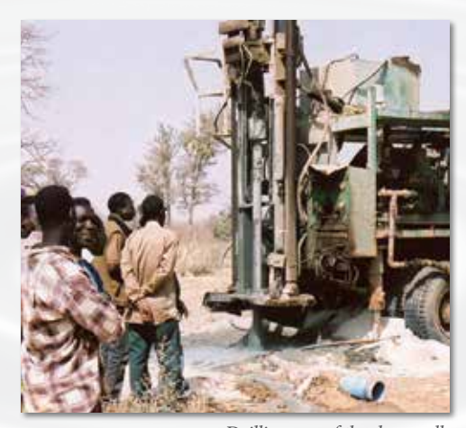
Drilling one of the deep wells

In Cambodia, teams have worked with funding and helping to build the Bakong Technical College (BTC). It has also lead to funding a local orphanage for 25 children and supporting a village with cows and bikes.