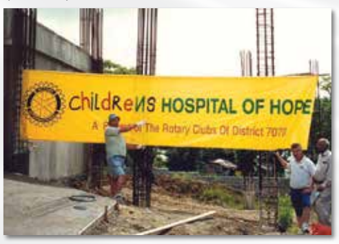
Working on site

The trip to Burkina Faso was also done in partnership with Careforce. Our work helped build a village for marginalized children. We also provided five wells. In Tanzania a large part of the sweat equity work has been the building and renovating of nine schools. Additional projects that have grown out of these trips. It has resulted in ongoing sponsorship of 110 children in a bursary program for AIDS orphans, significant contributions of equipment to the local hospitals and a number of AIDS-related projects. It also led to the creation of a Rotary Club in Kilema. The Tanzania trips have been in partnership with Canada Africa Community Health Alliance (CACHA), an NGO based in Ottawa and Canadian Support of Rural African Initiatives (CSRAI).