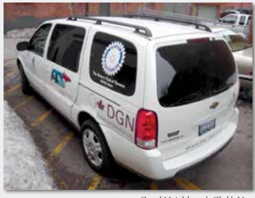
Good Neighbour's Club's Van

Over the last ten years CSC has assisted a variety of community organizations; a) Alternative Land Use Services that provided seed funding for ecological goods and services and would impact one of the GTA watersheds, b) Broadview Community Youth Group that provided a week-long day camp experience for twenty youth, c) Community Resources Consultants of Toronto promotion health program that focused on hunger prevention, nutrition promotion for single women with children who moved from the hostel to the shelter system, d) a donation was made to Food Share's program, a recycling and composting initiative to grow food & educate community, e) 416 Drop-in Centre for Homeless Women received a needed commercial refrigerator, f) Furniture Bank was granted funds for kitchen tables, kitchen wares and mattresses for refugee families and families coming out of homeless shelters and agencies, and g) partial funding contributed to the purchase a used van for the Good Neighbour's Club.