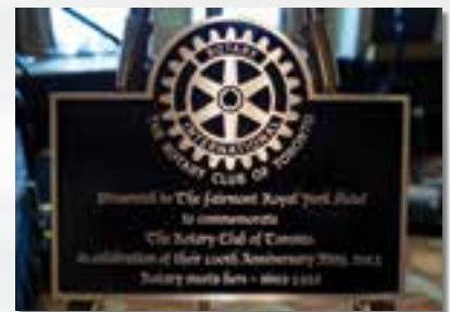
Club Centennial plaque for The Fairmont Royal York