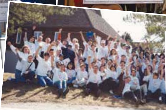
CAMP ENTERPRISE 1992 Rotary Club of Toronto