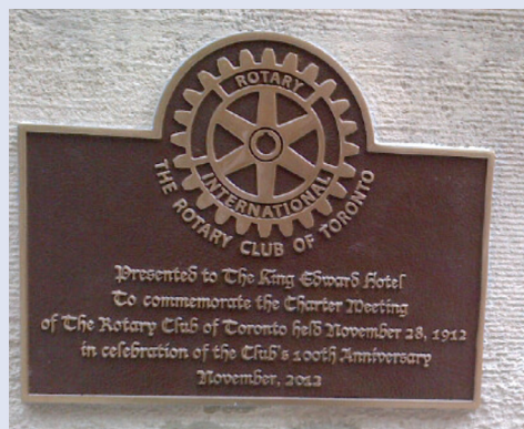
The Plaque presented to The King Edward Hotel, already mounted by its Victoria Street entrance