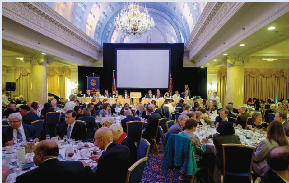
Over 320 Rotarians and guests celebrated Founder's Day at The King Edward Hotel, the location of The Rotary Club of Toronto's first meeting 100 years ago