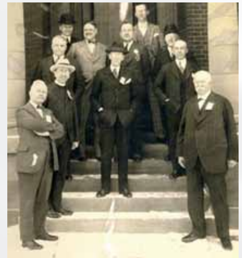
The Winnipeg Club's first regular meeting was held in the Travellers Building. Notable among the Rotarians at the 1929 International Goodwill Weekend in Winnipeg was Rotary founder Paul Harris (center).