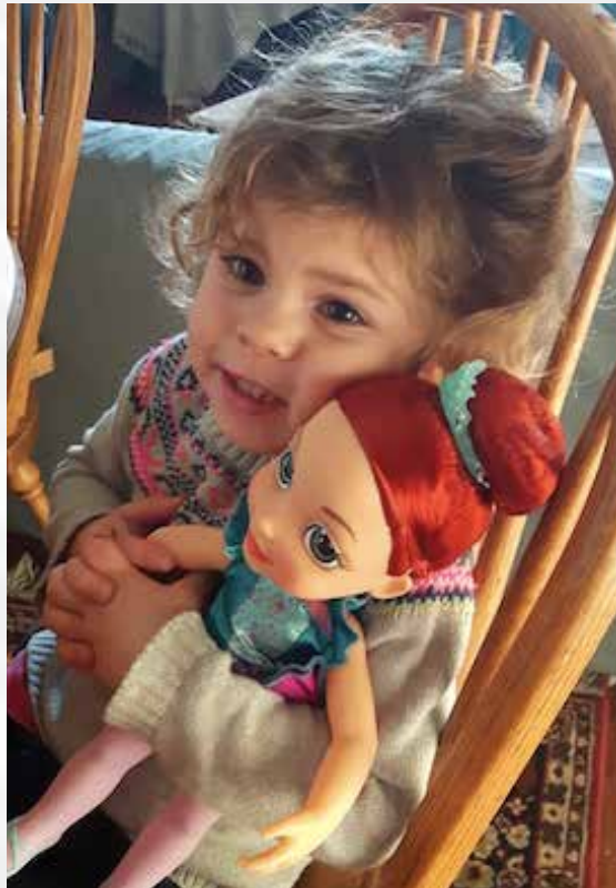
As we wait for our family some of the toys from our Christmas Club Raffle are being enjoyed by children already here.

The response of our government and the thousands of citizens who are involved sets a wonderful example to the world. We are Canadian!