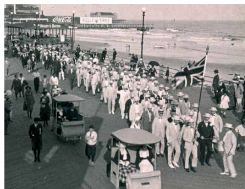
The Toronto Contingent in Atlantic City 1920

Are you one of the 35,000 who has registered for the convention already? If not, don't miss the opportunity to connect with new friends from around the world at the 2016 Korea Convention , May 28 to June 1.