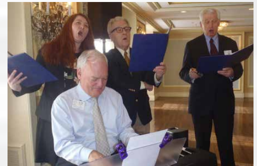
Upper Canada Room alive with the sound of music.