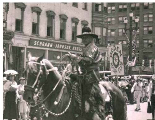
The first of two conventions held in Salt Lake City, this one in 1919

2018 – June 24 to June 27 right here in Toronto!