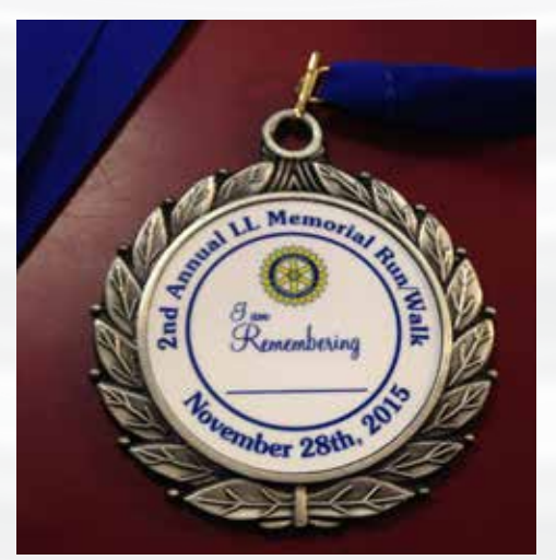
Memorial Run Medal