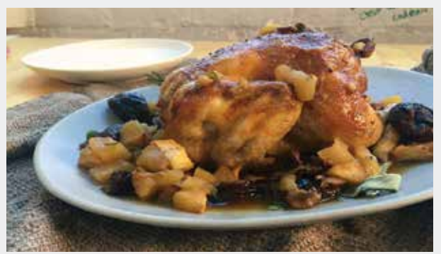
Cornish Hen Massimo

If you missed this one, feedback was so positive, we're looking at booking another – the whole supper club just for Rotary – to explore the region of Sicily to warm us up mid-winter.