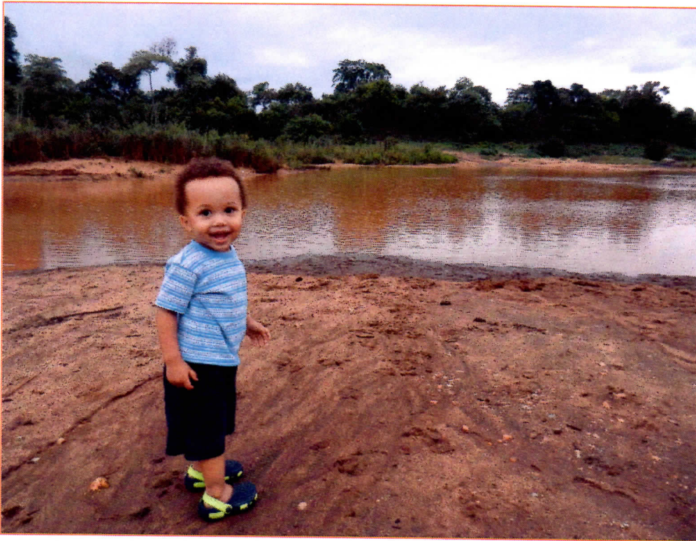
Watching out for crocs while wearing crocs!