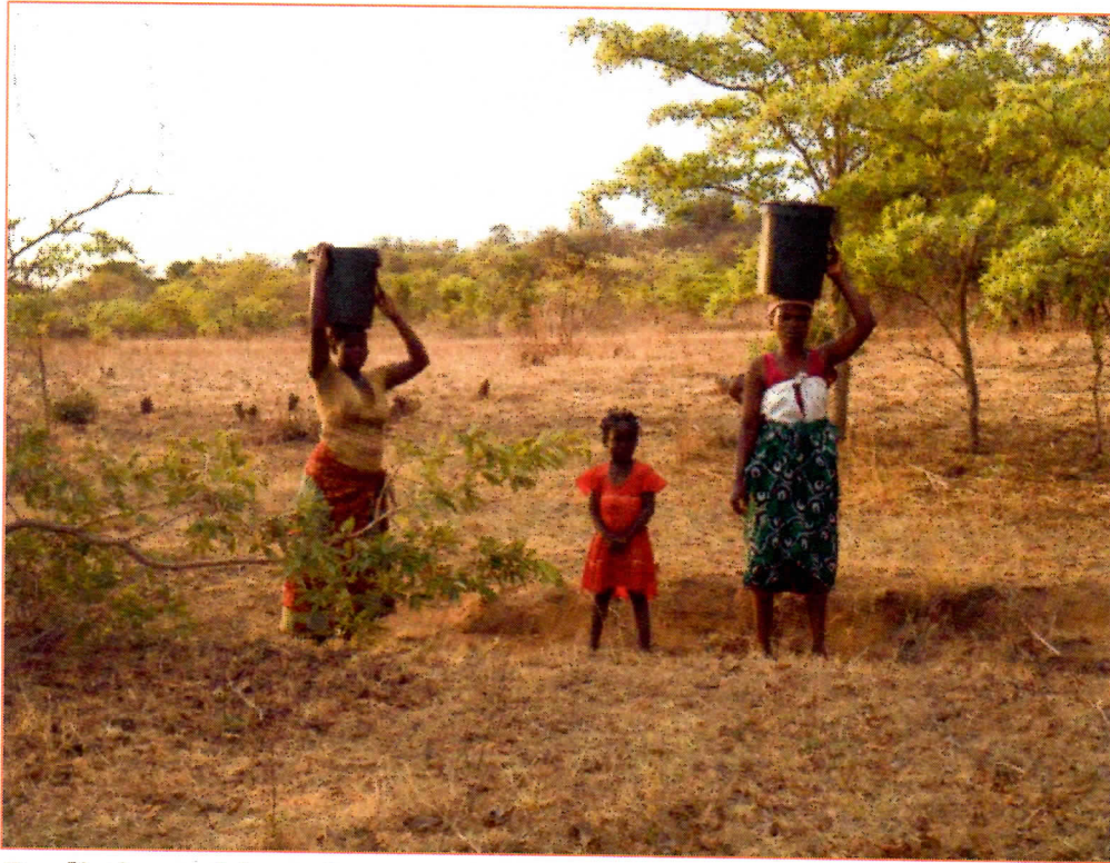
Predictions of drought