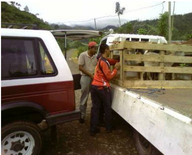
Transfer from truck