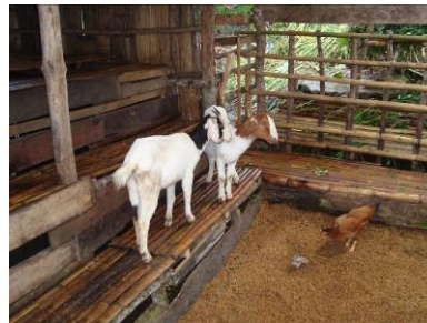
2 Goats and 1 Chicken