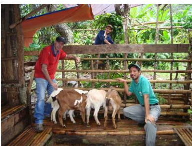
Clearly gaining weight