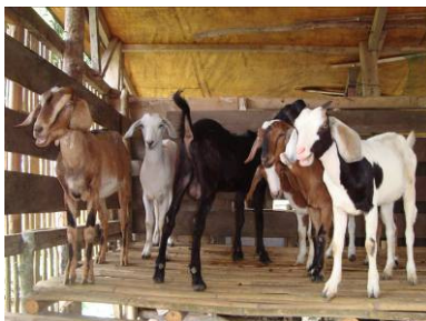
The male turns his back to us