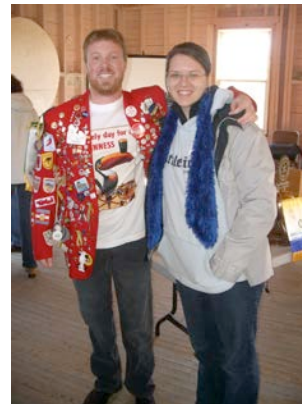
Exchange students, a local PolioPlus volunteer in Africa, Shelter Box display