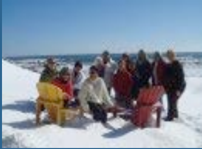
Harbourside Women's Whitepoint Weekend Retreat

Rotary Clubs are nonpolitical, nonreligious, and open to all cultures, races and creeds