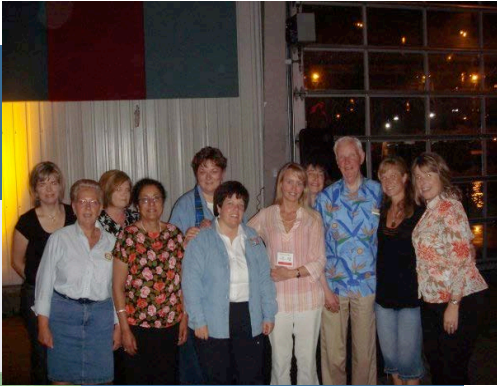
Left – Rotary Rafters at the Tidal Bore; Above – The women of Harbourside with a former Rotary International President at a Conference in Halifax

The Purpose of Rotary is... to encourage and foster: