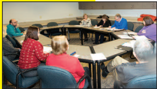
Photo: Board members meet before regular club session. All members are welcome to attend board meetings!