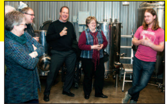
Rotarians enjoyed a purely social event Feb. 2 at Junkyard Brewing in Moorhead, where they learned about both process & product.