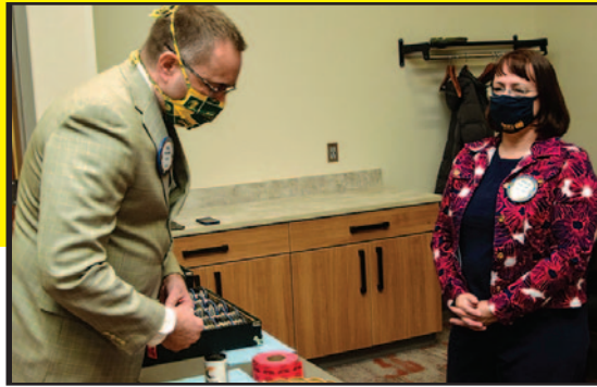
The board of directors met at the conclusion of our meeting.