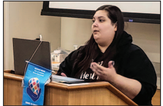
(Top) First Link operates a crisis telephone line, including a 24-hour suicide helpline accessed by calling 2-1-1.