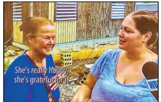
She's really happy she's grateful for it