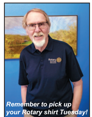
Remember to pick up your Rotary shirt Tuesday!