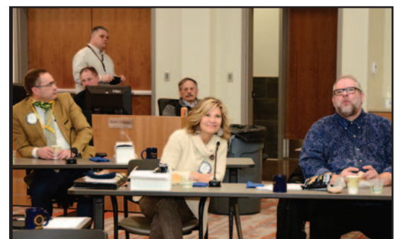
Last week's meeting combined 12 Rotarians who attended in person at the school operations center with another eight who continued to join via Zoom. If you plan to attend in the future, be sure to make your lunch reservation by noon on the preceding Wednesday at the link in your email.