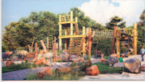
This artist's rendering of the "treehouse" or several play structures, shows the various materials used in equipment for free, unstructured outdoor play in the FM Rotary Foundation's Natural Park. Construction is planned for 2022.

The FM Rotary Foundation's Natural Playground project was featured on the front page of the Extra newspaper on March 4. You can read the story online at www.thefmextra.com/rotary-clubs-unveil-plan-for-natural-playground/