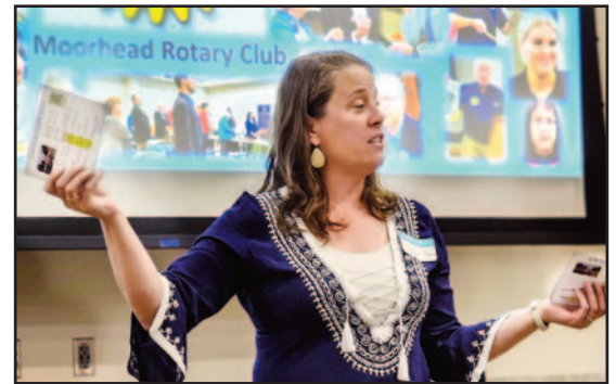
executive director of the Moorhead business organization in 2018.