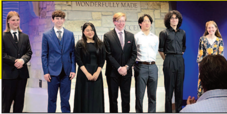
(Center and right) Scenes from the 2023 Recital with a Cause on May 4.