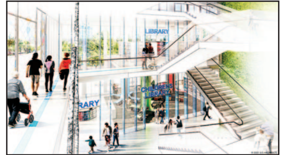
Architectural renderings of Community Center and Library — indoor playground and walking track.

the five raffle tickets required to be entered in a prize drawing next week. Only two members have not yet picked up their packets ... if you're one of them, please do so now.