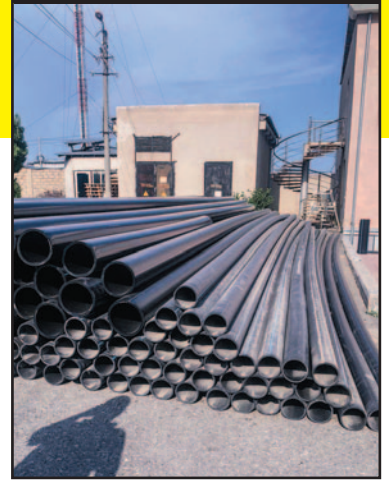
Varzi-Kanda village in Tajikistan. Irrigation water line. Stockpile of pipe awaiting installation in Varzi-Kanda.