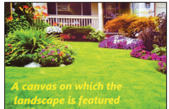
A canvas on which the landscape is featured