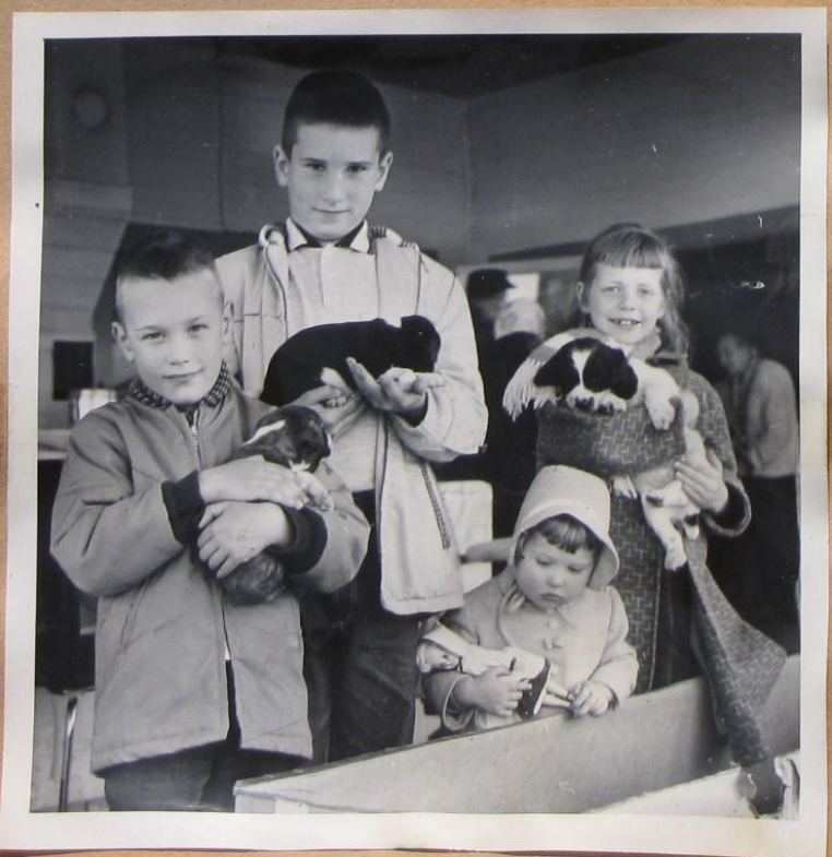
FUTURE SWIMMERS FAMILY TOPOLES