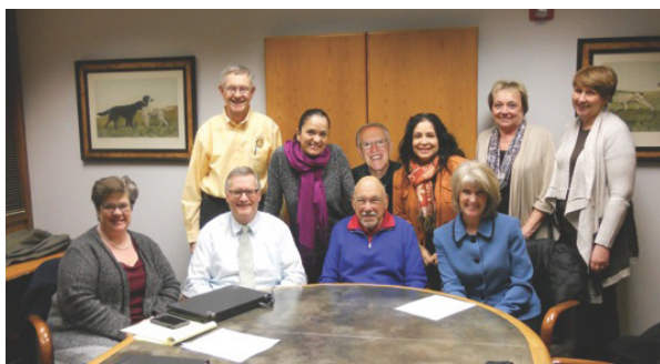
Your Wenatchee Rotary Foundation Board