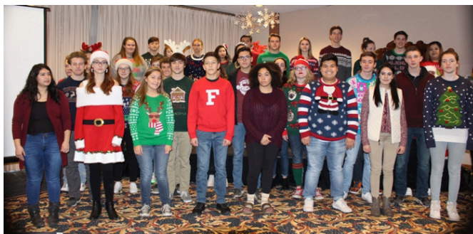
Eastmont High School Choir