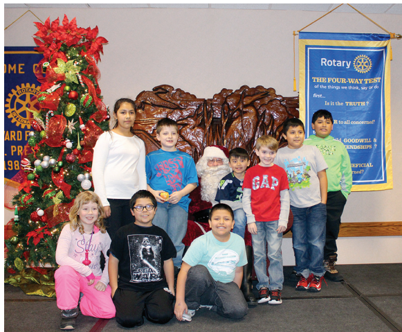
Santa with our Lunch Buddies