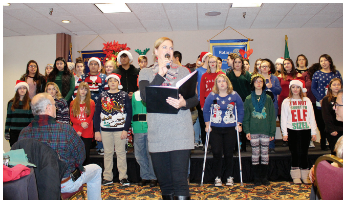
Eastmont High School Chamber Choir