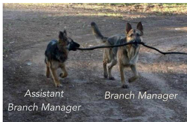
Assistant Branch Manager

Sign up early to receive best prices and don't forget to sign up for Home Hosting, tours and lots of fun Rotary Fellowship. To register just go to the District website and click on the District Conference Registration form. Now isn't that easy?