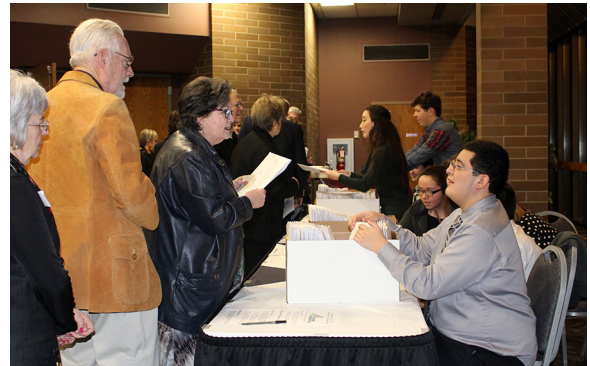
Interact Kids helping to check people in.