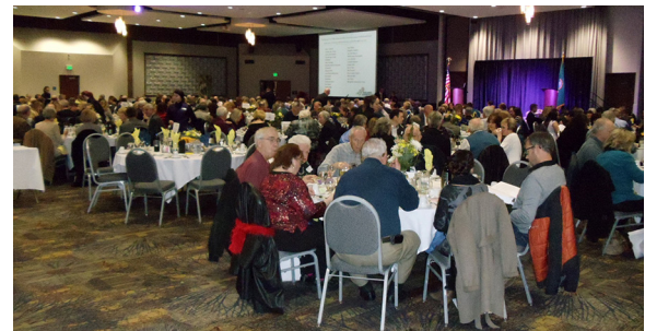
Packed House ready to go.