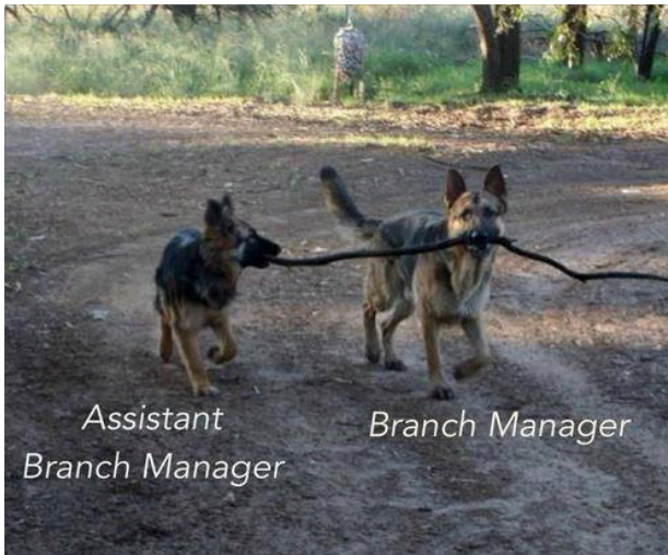
Assistant Branch Manager

Our Auction is only about 3 weeks away on Saturday night, January 30th. If you have not yet bought your ticket please do so NOW. Also bring a friend, we have only sold 146 tickets so far. For this auction to be a success we need to have at least 250 to 300 bidders present. If we do not reach our goal of $100,000 it means that we will have to have another fund raiser again next year. We need everyone to participate to reach our goal. The two things that you can do is procure items for the auction and sell tickets. So do it now!