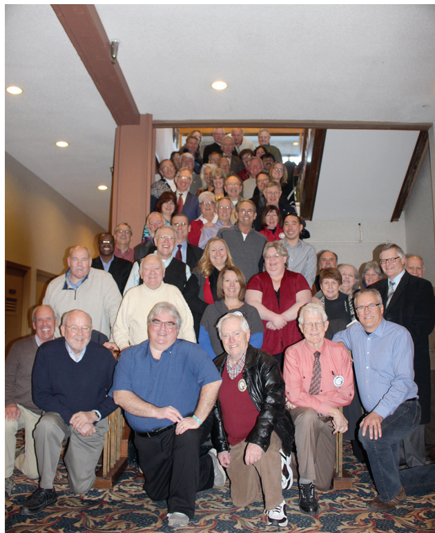
Wenatchee Rotary January 2017