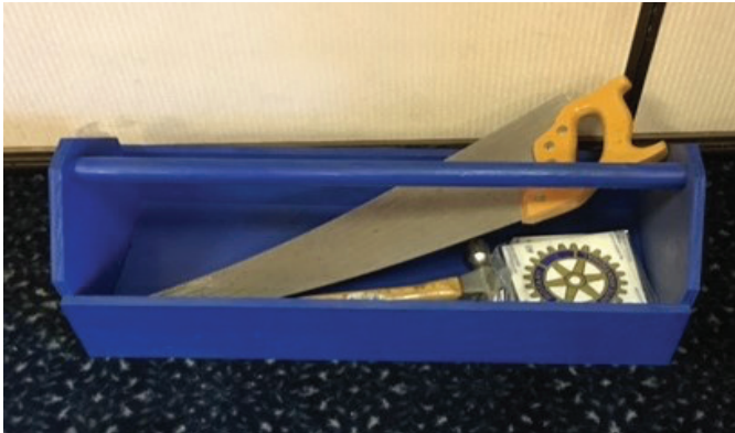
Tool Boxes made by the Wenatchee Valley Tech Center

As all members know by now, for the auction event we will have carpenter's boxes as table centerpieces. We are also gathering tools of many types to make our carpenter's boxes look authentic. The boxes along with the tools and flowers will be sold off the evening of the auction, with any leftover tools donated to the Habitat for Humanity Purple Door Store. My first thought was for carpentry type tools, but we will also accept hand gardening tools as well.