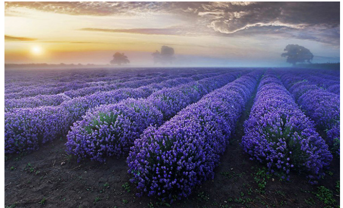
Lavender Field at Dawn – Imagine the Aroma