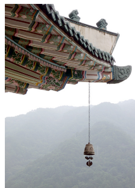
Corner of a museum in North Pyongan Province