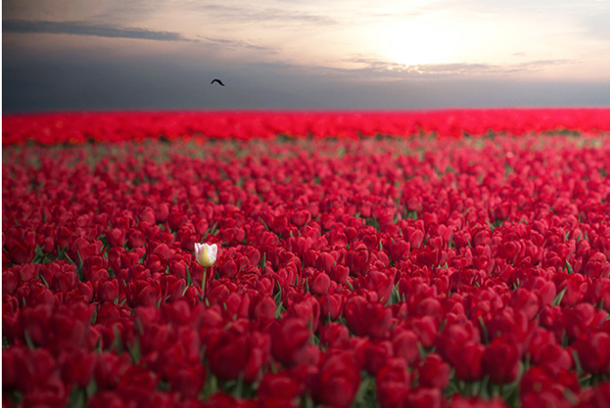
One in a Million

Wenatchee – East Wenatchee – Omak – Oroville