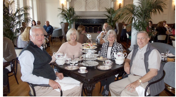
High Tea at the Empress Hotel

-LIFELINE- Ambulance, Inc. (509) 663-8091 Wenatchee – East Wenatchee – Omak – Oroville