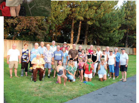
Wenatchee Rotarians in Attendance