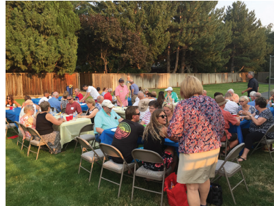
Enjoying some Rotary Fellowship