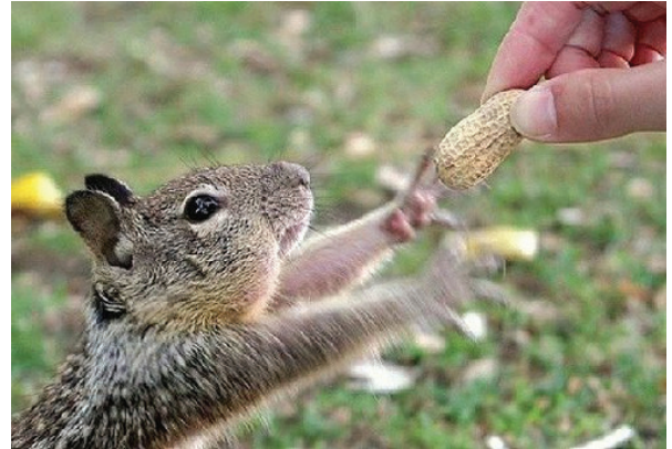
Everyone wants a handout!

Board of Directors (BOD) - Thursday afternoon the club's new officers and directors met for the first time of the Rotary year. Names & positions of the 14 members are listed on the web site home page. The agenda included such matters as Firesides, dues-collection issues, bad debt, improving quality and cost of financial reports, Appleseed preparation and sponsorships, Foundation goals (after such a great year of fund-raising), satellite clubs and fellowship gatherings. A discussion on disposition of leftover WRF funds for the recent Haiti project was tabled pending availability of affected members. A dues discount for members under age 35 was reaffirmed until future consideration. The board discussed the newly developing multicultural satellite club and decided that attendance qualifies as a makeup meeting, just as with the ongoing Friday fellowship gathering at Pybus Market.