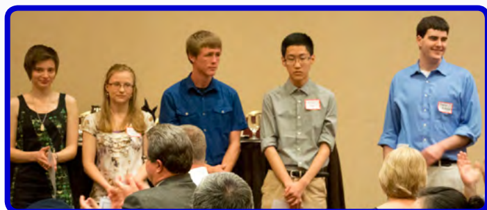
Richland High School Class of 2013 Merit Scholars.