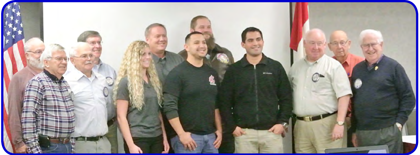
Photo above is a combinatin of Rotarians and WSU Tri-Cities students who have served in the US Military.

"That wasn't my daddy," said the little boy. "He just walked up, took me by the hand and said, 'Come on kid, we're going to get a free haircut.'"